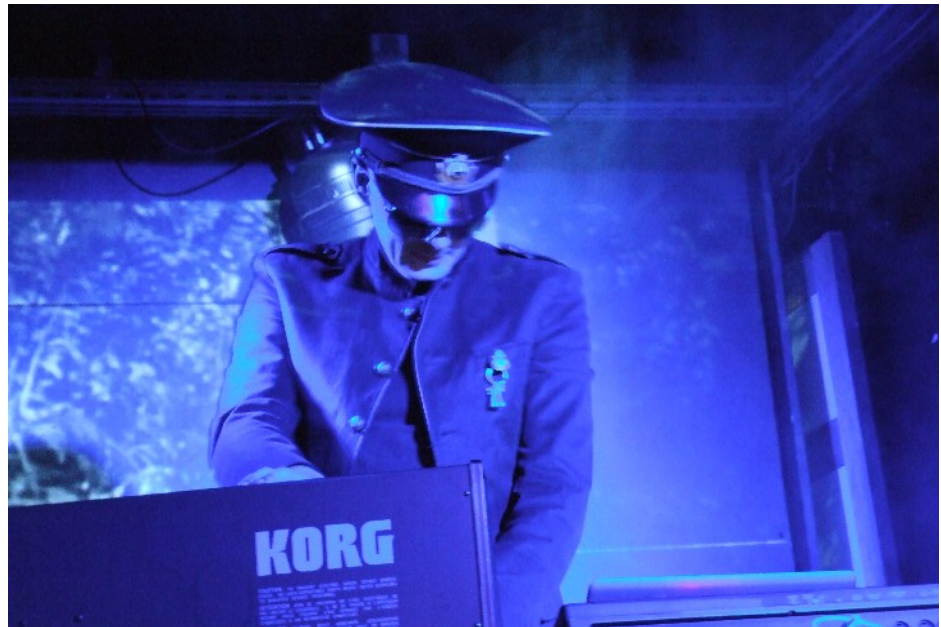
Live at les Combustibles